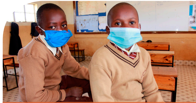
Tough Year It Was But Still Focused!

2020 was such a tough year for everyone but we are pleased to say thank you Lord! We had a smooth reintegration back to the phased contact-based learning in October 2020 to the full school reopening in January 2021 through Easter.